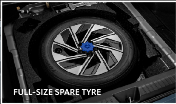
FULL-SIZE SPARE TYRE